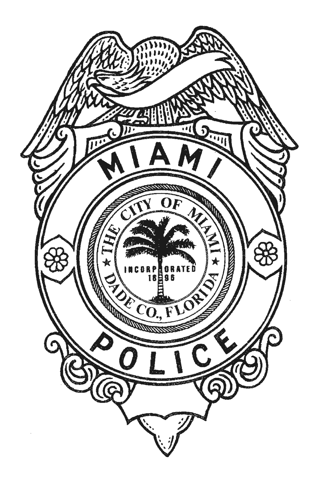
RECORDS UNIT STANDARD OPERATING PROCEDURES